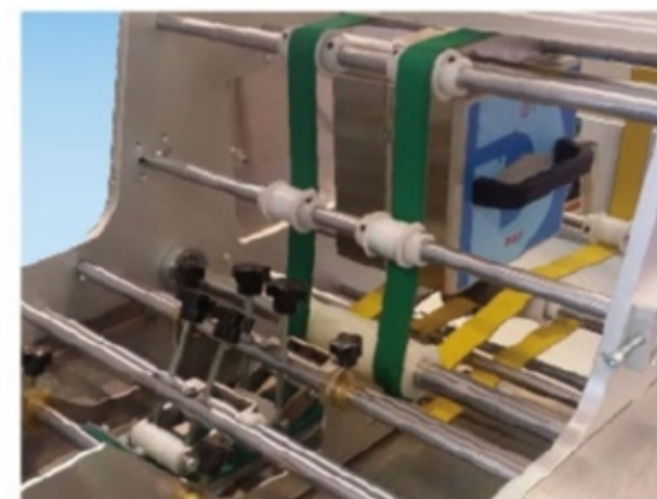
D05 installed on Feeder